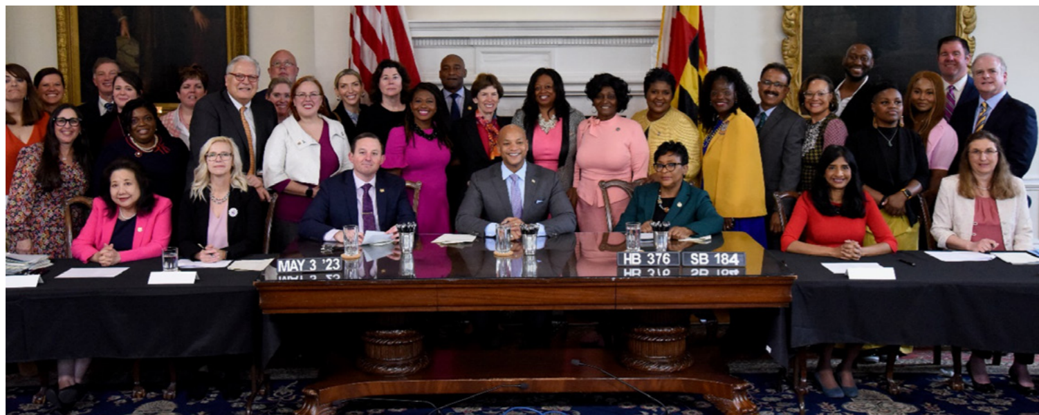
FORCE and its Patient Advocate Leaders (PALs) collaborated with partner organizations to pass a new Maryland law that eliminates out-of-pocket costs for high-risk breast screenings and diagnostic exams. Pictured here is the bill signing with Governor Wes Moore on May 3, 2023.

2023 was another successful year of championing state and federal public policy initiatives on behalf of the hereditary cancer community. We continued to spearhead the Reducing Hereditary Cancer Act to enable Medicare coverage of genetic counseling, testing, screening and interventions. We weighed in on telehealth expansion, national guidelines for preventive services and FDA oversight of laboratory-developed tests. We were instrumental in the successful effort to preserve insurance coverage of advanced breast reconstruction techniques, ensuring that those who undergo mastectomy have access to a broad range of reconstructive options.