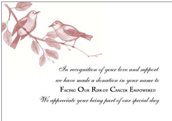
D5 - birds