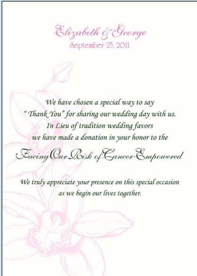
Large - 5x7" (table/display card)

Following card size options are available with all designs