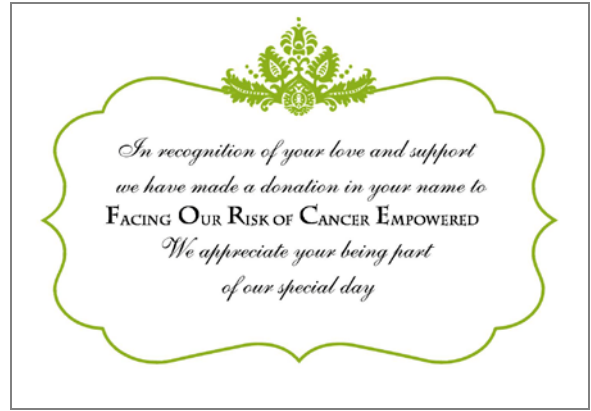
D2 - floral border