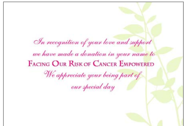
D6 - leaves