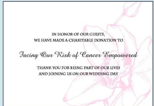
Medium card - 3.5 x 5"