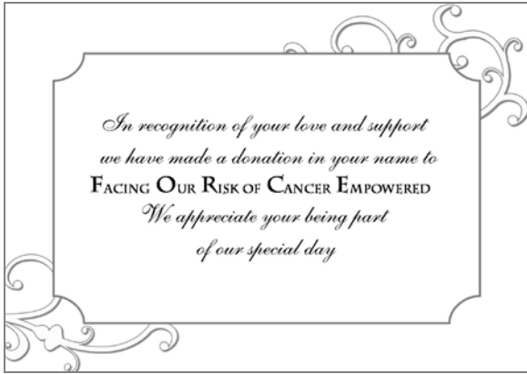
D1 - elegant border