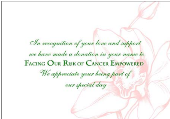
D3 - orchid