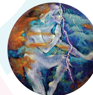
Atmosphere

Conference on Hereditary Breast and Ovarian Cancer